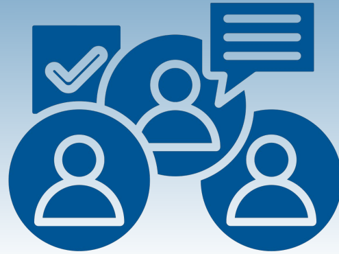
District Family Communication