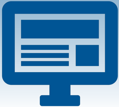
School & District Websites